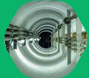
Underground Electric System