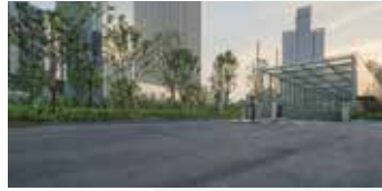
NH58 - 100M