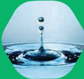
Rain Water Harvesting System