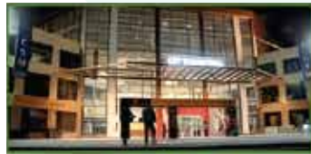
CSM MALL 5 KM