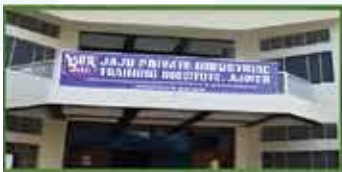
JAJU ITI 3 KM