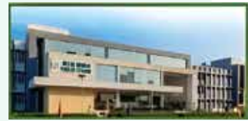
DWPS SCHOOL 1.75KM