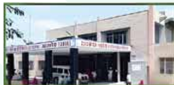
JANANA HOSPITAL 2 KM