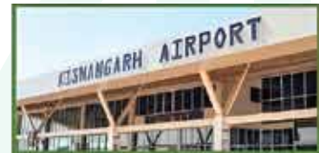
KISHANGARH AIRPOT 16KM