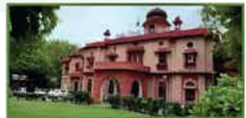
NEW NAGAR NIGAM OFFICE 6.5KM