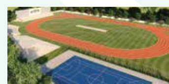
SPORTS STADIUM 4KM