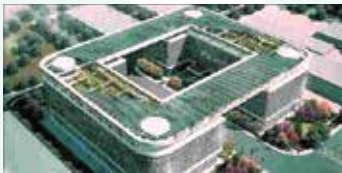
IT PARK 1.25 KM