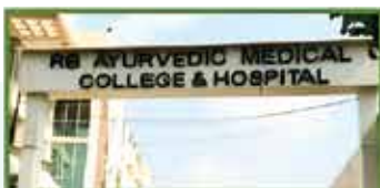
AYURVEDA UNIVERSITY 4KM