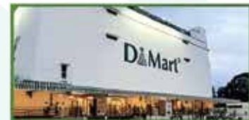
D- MART 5KM