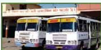
BUS STAND 8KM