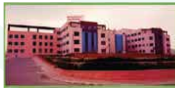
BHAGWANT UNIVERSITY 1.75KM