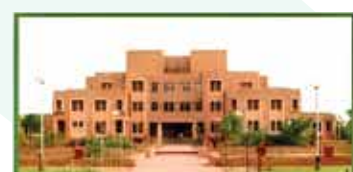
MDS UNIVERSITY- 4 KM