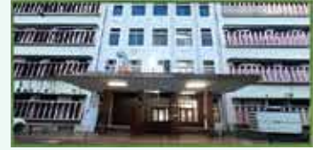
MEDICAL COLLEGE 1.25 KM