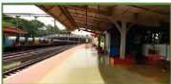
MAKARAWALI RLY. STN. 2KM