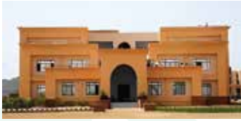
AIT COLLEGE INFRONT OF PROJECT