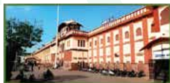
RAILWAY STATION 10KM