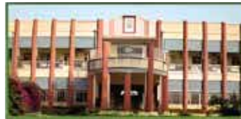
SCIENCE PARK - 6.5 KM