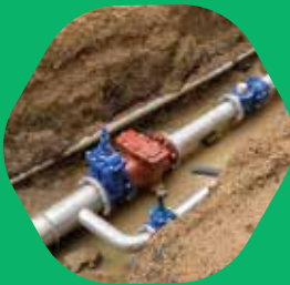
Underground water line